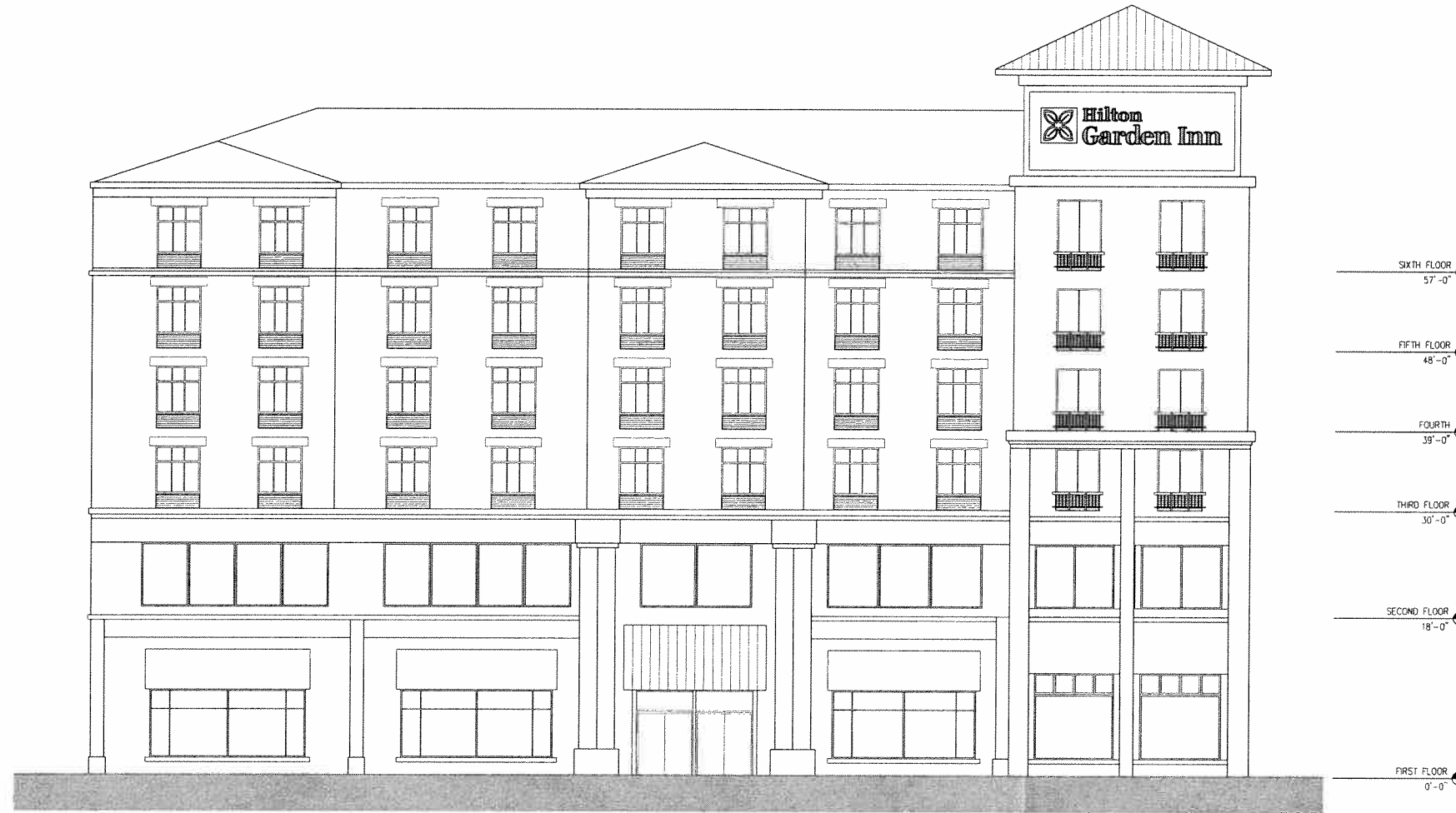
1 MAIN STREET ELEVATION A101 SCALE: 1/8"=1'-0"

THIS DOCUMENT IS THE PROPERTY AND EXCLUSIVE PROPERTY OF COLE + RUSSELL ARCHITECTS, INC. WHETHER THE DOCUMENTS ARE THE PROPERTY OF COLE + RUSSELL ARCHITECTS, INC. OR NOT, IT IS TO BE KEPT AND NOT REPRODUCED WITHOUT THE EXPRESS WRITTEN CONSENT OF COLE + RUSSELL ARCHITECTS, INC. Printed: November, September 27, 2008 1:08:34 PM